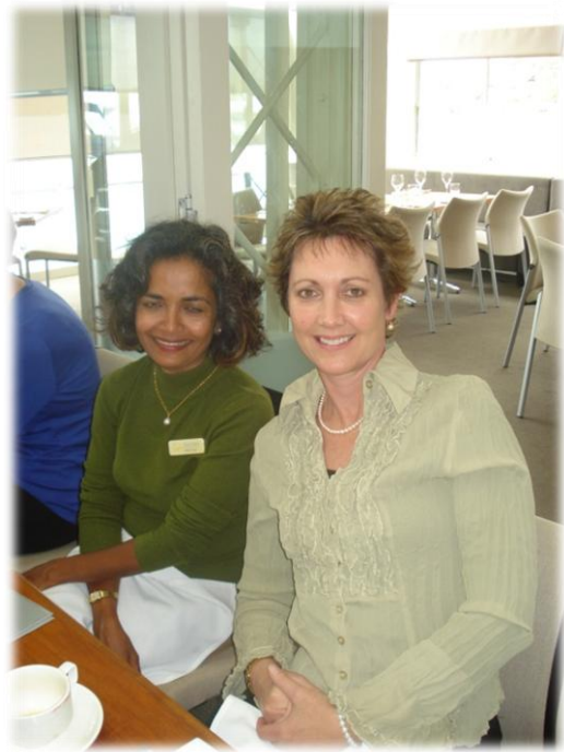
Volunteers Morning Tea Event

As a non-profit organisation SolarisCare consistently demonstrated its appreciation for the energy, warmth and generosity of its volunteers through a diverse set of coordinated and Centre specific activities including a breakfast and ceremony to present certificates of appreciation for years of service, a Christmas Party (one metro and one regional), a Volunteer's Morning Tea event at Mosman's Restaurant during National Volunteer Week 2011, a free SolarisCare polo shirt and birthday cards.