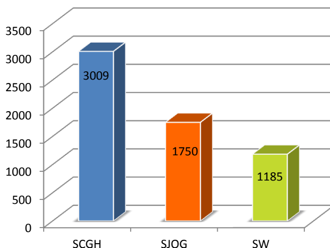
Figure 1. Number of therapy sessions delivered in 2010/2011

In all three Centres the most important sources of information or referral to the services of SolarisCare (which encouraged them to visit a Centre) was through nursing staff, family and friends and our brochures.