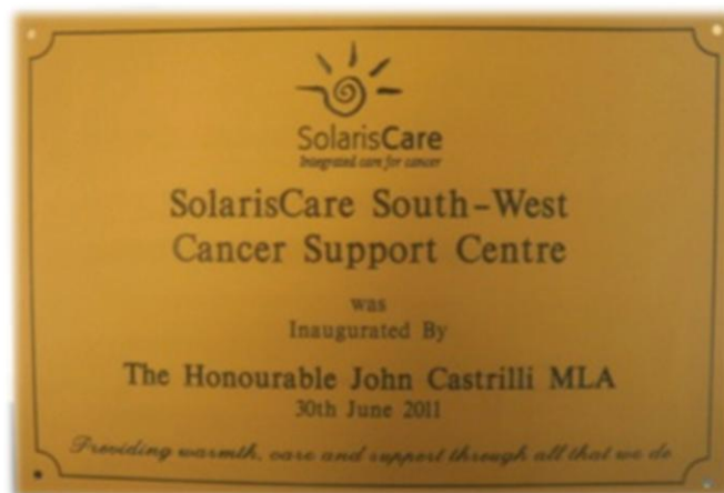
Plaque for the new SolarisCare South West

The support from the Bunbury community has been overwhelming considering the SolarisCare Centre is the new kid on the block competing for support alongside longstanding established organisations. The “Thank You Board” has over 60 plaques on it in recognition of clubs, organisation and individuals who have contributed to the Centre in kind or cash. Special recognition to “The Good Guys” Bunbury who have supplied all our electrical products at cost, and to Super IGA Bunbury who through their “Community Chest” give us $100 credit per month for all our grocery needs.